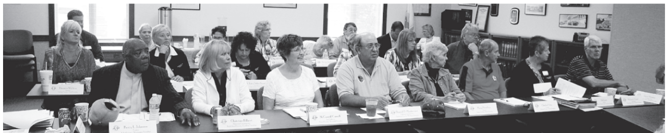
TOI BOARD MEMBERS in the TOI office.